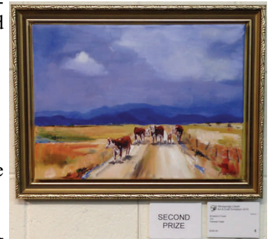
Two of our prizewinners at Lillipilli!