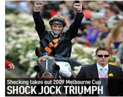
Shocking takes out 2009 Melbourne Cup SHOCK JOCK TRIUMPH