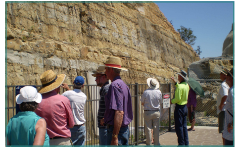
At the Spillway Wall