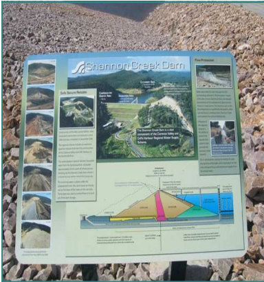
Beginning to End - The Plan