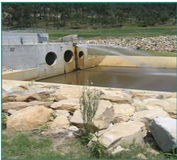
The Eco Flow Station