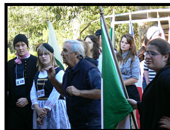
Preparing for the flag parade