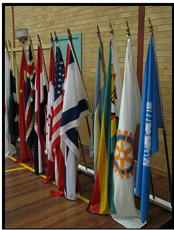
Flags of some delegate countries