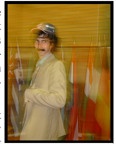
Was that Borat?

Some needed more information, eg: “I wasn’t sure what to expect but everything else was very good”; “Perhaps a little more information about the real UN.”; and “Amount of bribes needed would have been good to know! 4 bags of lollies isn’t enough!!!”; “We felt we were very ill-prepared coming into it as we hadn’t been told exactly what to do with speeches etc but when we got here most people were the same and we learnt as we went along which was fine.”; “Timetable in regards to when to wear national dress etc was a little unclear.”; “The information we received prior to the event was a bit vague.”; “I might have liked a little more description on what information I needed.”