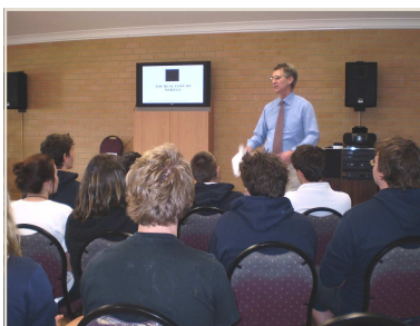
Wheely expensive - Finance & Insurance