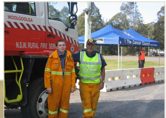
Some like it hot