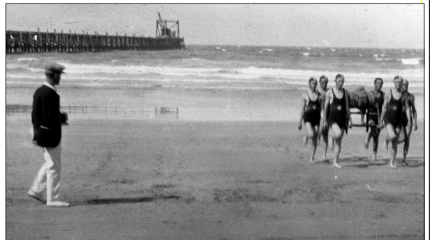
Photo at right shows the old style surf life-saving reel and a local team training to use it on Woolgoolga main beach (Woolgoolga Jetty in the background). The surf life saving club is hoping to treat us to a display of this old-style equipment at our heritage celebrations on 9 June.

Check out our new Heritage Walk Website: