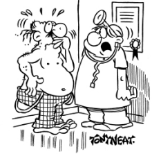
"As for your amnesia problem, just try to forget about it!"