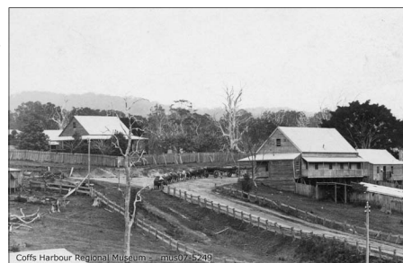
Photo at right shows Woolgoolga in 1910 with a bullock team hauling timber along the street, a common sight in those days and for many decades afterwards. Reliving the sights and sounds of a bygone era, a friend of mine in her 80s mentioned to me that she grew up in the hinterland not far from here and as a small child used to rush out to see a neighbour drive his bullock team past. She knew all the bullocks' names and one day announced to her mother that there seemed to be a new bullock on the team called "F....n"!!!.