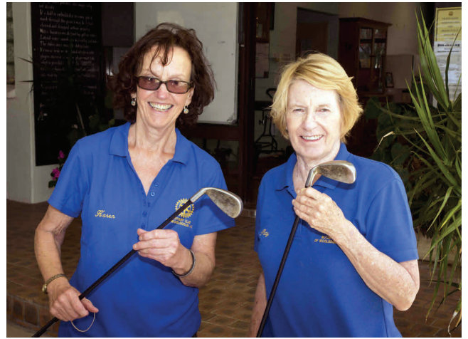
Helicopter golf ball drop 2014