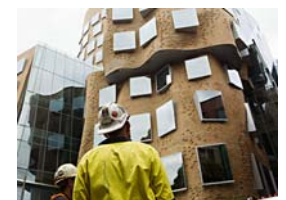
An engineering challenge! Gehry-designed building at UTS