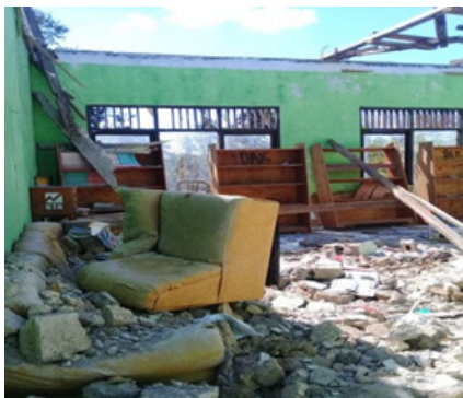
NTA is assessing the damage caused by the Cyclone in Sumlili left: Kupang Barat High School, completely destroyed; right, shared library in Sumlili