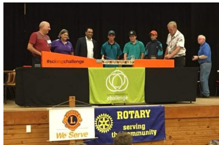
Science & Engineering Challenge, clockwise from top left : Helter Skelter tower (+ centre); bridge & officials; bionic hand (Grasping at Straws); Turbine (2); bionic hand; Stringways