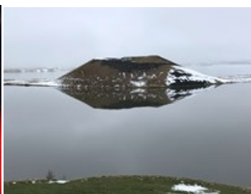
9 Jun reflection of pseudo-crater, Skútustaðagígar