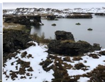
8 Jun Kálfaströnd, Mývatn lake