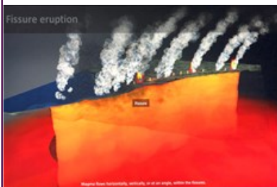
31 May ..the latest eruption is a fissure eruption