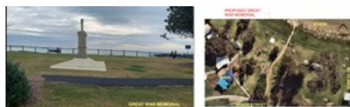
Photos showing similar idea and the site area of proposal

This is a project instigated by the Woolgoolga RSL and one in which we are pleased to assist as a Rotary Club. If you would like to participate in the survey then please cut and paste the following link into your browser. https://us17.list-manage.com/survey?u=76f01c1c2935a22928e87d693&id=c9eeddf578&attribution=false