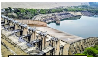
Mangla dam Pakistan