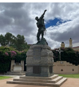
At left: War memorial in Broken Hill.