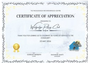
Certificate of Appreciation from Woolgoolga Neighbourhood Centre